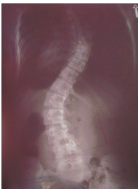
Before Surgery 55 degrees (Both Thoracic and Lumbar)

Some excess amount was reserved for Aziel's follow-up consultations and other related needs