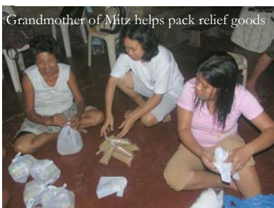
Grandmother of Mitz helps pack relief goods